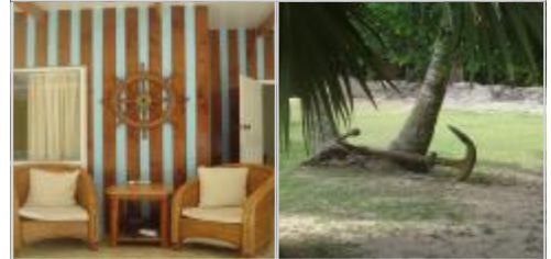
Anchor's Rest - Your Home Away From Home