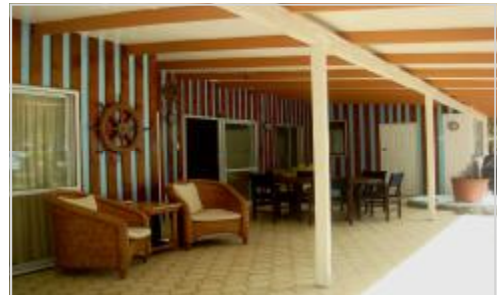
Relax On The Porch