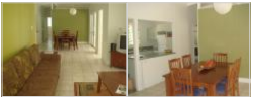
Living & Kitchen Area