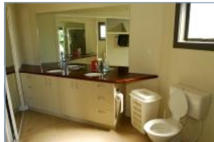
LOWER FLOOR BATHROOM