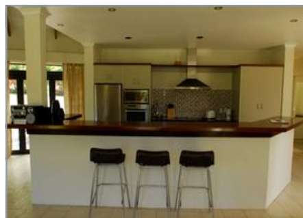
THE OPEN PLAN KITCHEN ENSURE THAT THE COOK WON'T MISS OUT ON ANYTHING