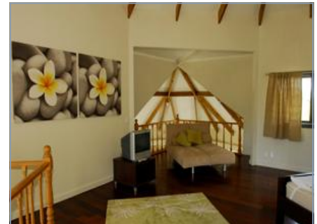
TOP FLOOR LOUNGE AREA