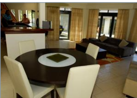
MODERN FURNITURE COMPLIMENT THE OPEN STYLE OF THE VILLAS