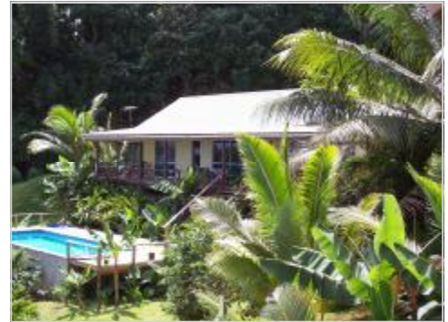
Amuri Pool Villas

Grocery stores, Internet cafe, post office and the Banks are all only minutes away.