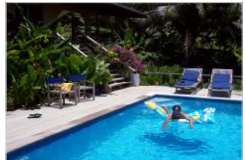
Cool down in the pool...