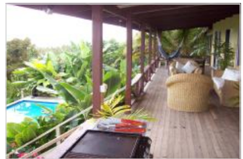
Enjoy the views from the deck...